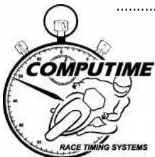
Clerk of Course - Peter Woods